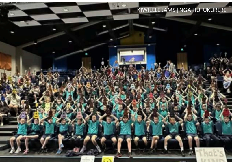
KIWILELE JAMS | NGĀ HUI UKURERE